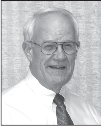
Wayne Miller Home Loans